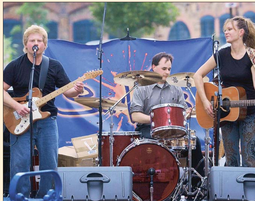
First Friday on Bank Street.

"The block with most of the shopping is about 50 percent completed, but the whole project has a long way to go," continued DeMutis. "I'd say the town is about 5 percent of the 100 percent we want it to be."