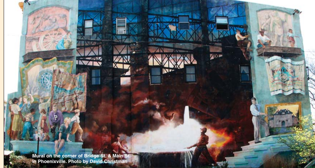
Mural on the corner of Bridge St. & Main St. in Phoenixville.