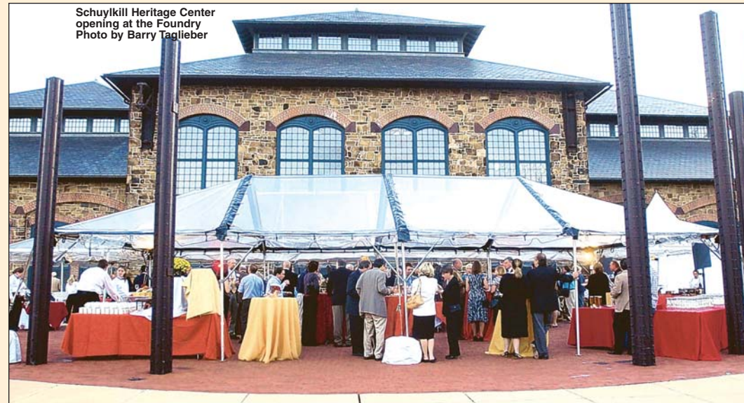
Schuylkill Heritage Center opening at the Foundry

Like polished spokes on a shiny new hub, specialty shops ranging from 450 to 2,000 square feet share a handsome streetscape complemented by unique restaurants, coffee shops and pubs that beckon browsers in search of the chichi